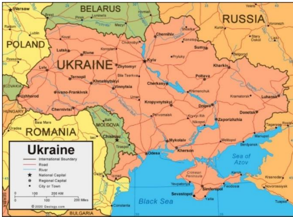
MAP OF UKRAINE BEFORE THE CRIMEAN WAR