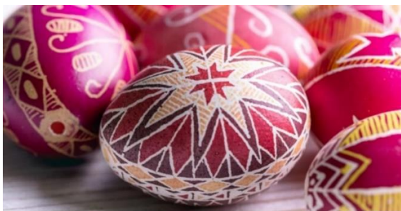
Pysanky, the Tradition of Ukrainian Easter Eggs & How to ...

Had I not traveled to Ukraine before the 2014 Russian-Ukrainian War, none of these photos could have been taken. With Zoom technology on a cell phone and the relationship with my niece, the captions of these photos would have remained all blank forever! Originally, I procrastinated in obtaining these captions from 2012 on and now these photos are priceless because their cemeteries and homes are no longer in existence any more following all the bombings taking place. Zoom technology has made a huge difference for my family to share these precious memories and hopefully motivate you to not take things for granted when the opportunities for unique family history fellowshipping that still might still be so readily available as a part of your genealogical pursuits with cell phones being so popular world-wide. My entire family is so grateful and lucky for these once in-a-lifetime experiences that we can all share them with our extended families and future generations. Yes, miracles are possible in today's crazy – mixed up world through 1) prayer, 2) fasting and 3) faith in your efforts!!! But you have to make those efforts.