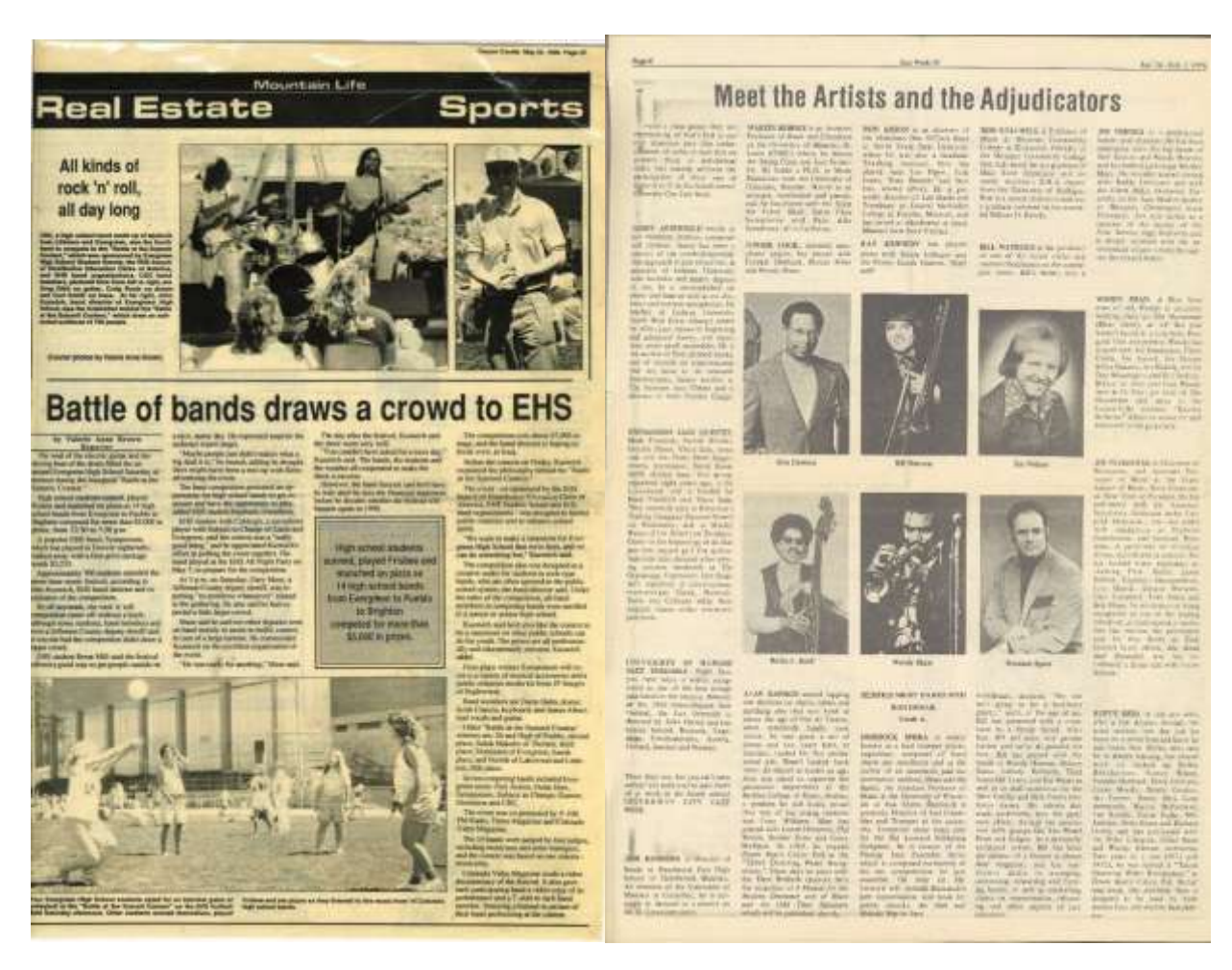
"Battle of the Summit Rock Band Contest" in Evergreen, Colorado. 1976 University City Jazz Week Clinicians.