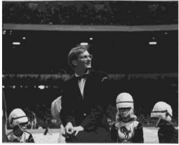
1966 World Music Contest in Kerkrade, Holland. Browns football game.