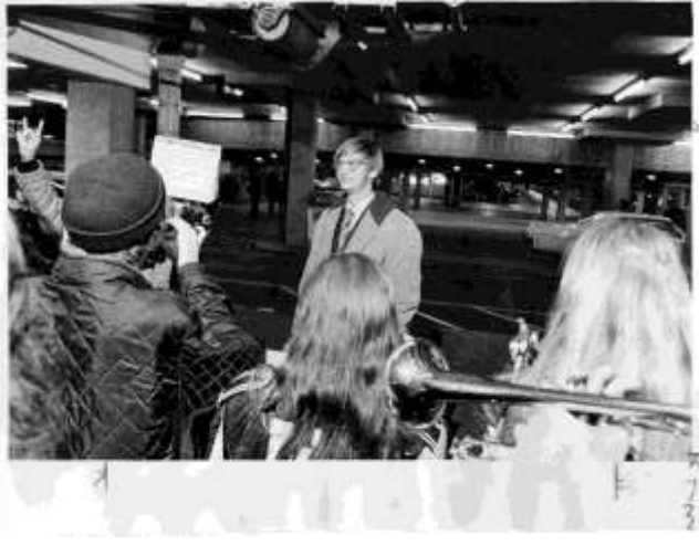
2013 Mt. Tai, Sacred Mountain, while teaching at Shandong University in Jinan, China. 1972 Surprise UCITY Pep Band Concert at St. Louis Lambert Airport.