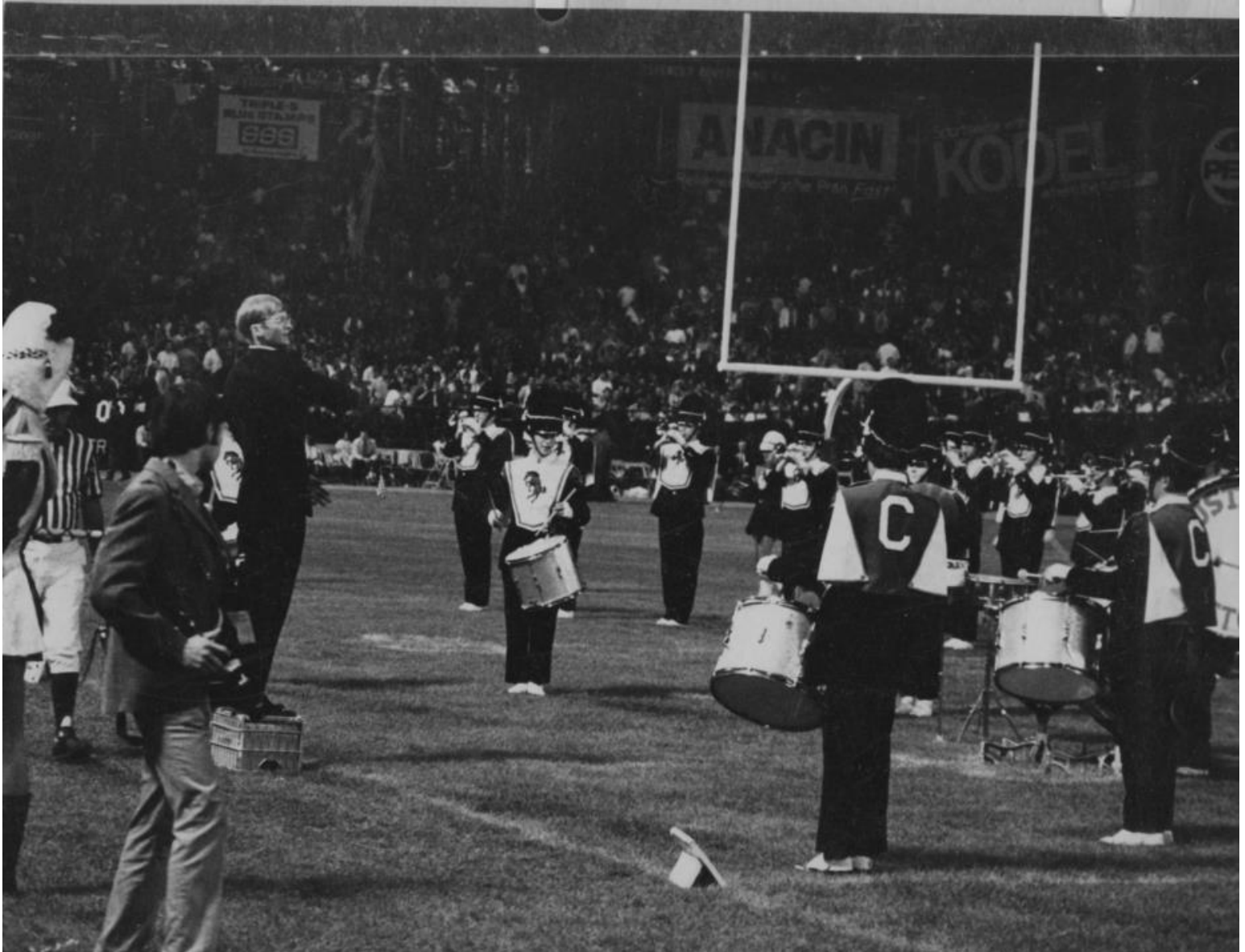
I directed the Clifton High School "Mustang" Band at in Yankee Stadium for the N.Y. Giants - Cleveland Brown NFL football game. Game televised nationally on CBS networks.

Go to http://jalbum.net/a/1764670 which includes a photo slideshow.